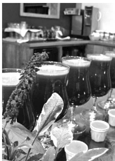
SEEING RED: Sweet organic beet juice is a favorite of the participants.

Situated thoughtfully under towering firs along the sea, it is close to the mouth of the famous Campbell River that the locals boast has "the best salmon fishing in the world." Just offshore in the Nookta Sound, seals, eagles, and great blue herons are spotted most every day.