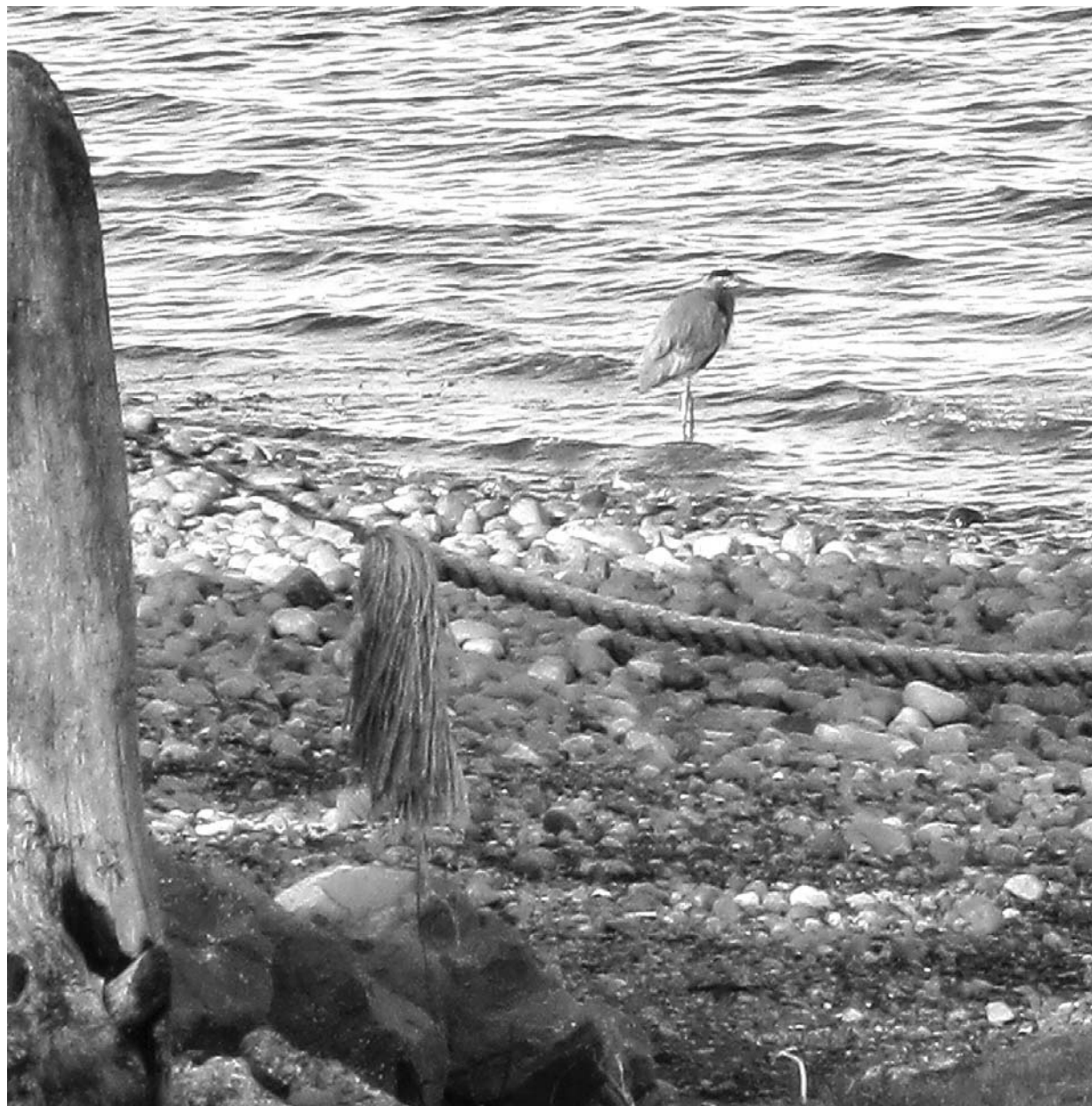
NATURAL ENVIRONS: Wildlife live and hunt along the sea at Ocean Resort. MICHELE M. WINNER

I like flying in the small planes. Sure they can be white knuckle thrill rides but these pilots have