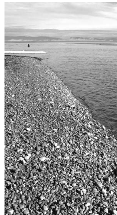
ALL PART OF THE EXPERIENCE: Raw food and raw natural beauty invite stark introspection. MICHELE M. WINNER

The 10- and 14-day programs are purported by Fresh Start to "have the biggest impact on your health; an all-in-one wellness program, lifestyle makeover, major degenerative