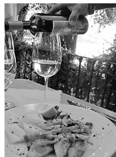
RUSTIC FLAVOR: Lunch at Grotto Del Parco in Morcote features fresh perch sautéed with artichoke hearts and served with roasted potatoes, a blend of flavors that were earthy and satisfying.

"Secondi" we had local perch sautéed with artichoke hearts and simple roasted potatoes. The rustic flavors were earthy and satisfying. We finished our bottle of wine and last spoonful of dessert with a sigh and began our journey home to the