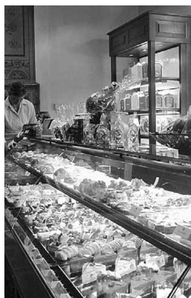
SWEET TREATS: Elegant pastries beckon from behind glass cases in old town Lugano.

greasy and just salty enough to be perfectly balanced. Coffee and frothy cappuccino capped our morning repast and sent us scurrying toward the waterfront.