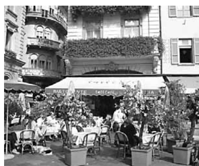
PICTURE PERFECT PAUSE: The main piazza della Riforma is the gathering place in old Lugano.

In the morning we wandered downstairs to breakfast and sampled local cheeses, airy croissants, fresh fruit, muesli, and pillow-y scrambled eggs. Italian-style bacon, almost a prosciutto style, was not