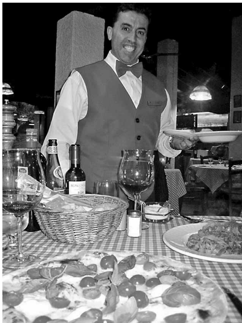
LOCAL FARE: Italian influences abound in Lugano, such as this well-garnished vegetable pie. KURT WINNER

Maintained for hundreds of years by the same families, these old structures serve as getaways for the locals. But as with most of the world's best water view locations, there is a growing number of "cold beds" as our guide called them (non-native or non-primary residences) "up in those cold, glass buildings." They were a complete