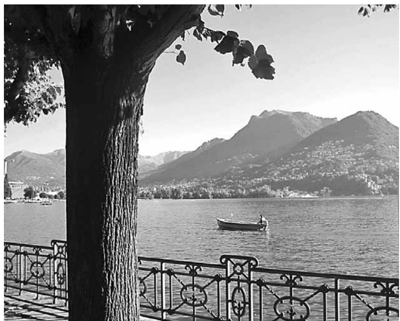
SCENIC WALK: The Lugano promenade follows the curve of the lake and is a favorite for joggers, dog walkers, and sightseers. KURT WINNER