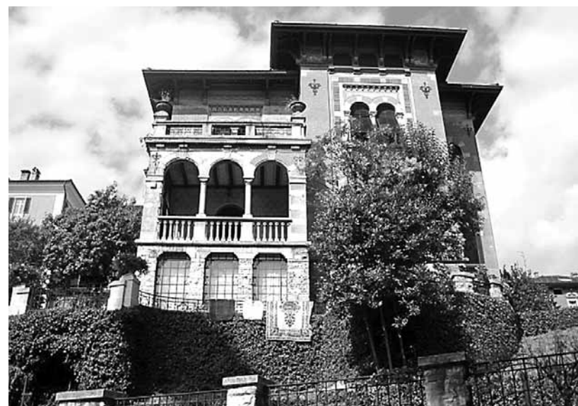
PROUD PALAZZOS: These stately mansions still require housekeeping, so they have to air their rugs somewhere! KURT WINNER