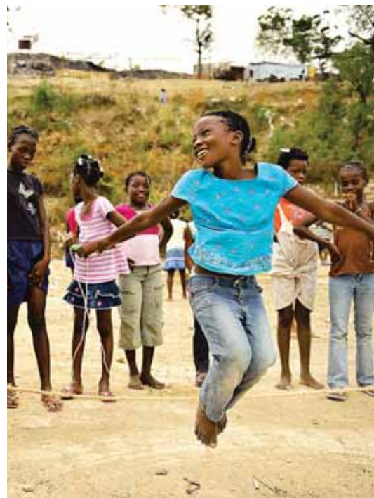
ABOVE: Women participating in the "Women: Box of Grief" project in Haiti. The project encourages women who have experienced violence to share their experiences and in this way find solutions to their problems. LEFT: Young girls are jumping rope in Terrain Acra Camp, Port-au-Prince. Women and adolescent girls are a regular target of sexual violence in the camps of earthquake-devastated Haiti.