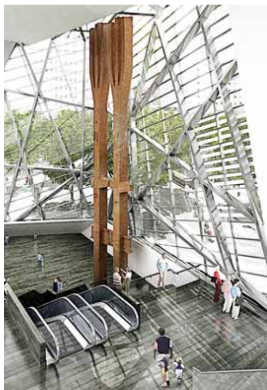
ORIGINAL FOUNDATION: An artist's rendering of the 9/11 memorial museum atrium entrance, slated for completion in 2012. Featured prominently in the design are two, three-pronged tridents, which were salvaged from the rubble after the 9/11 attacks. SQUARED DESIGN LAB