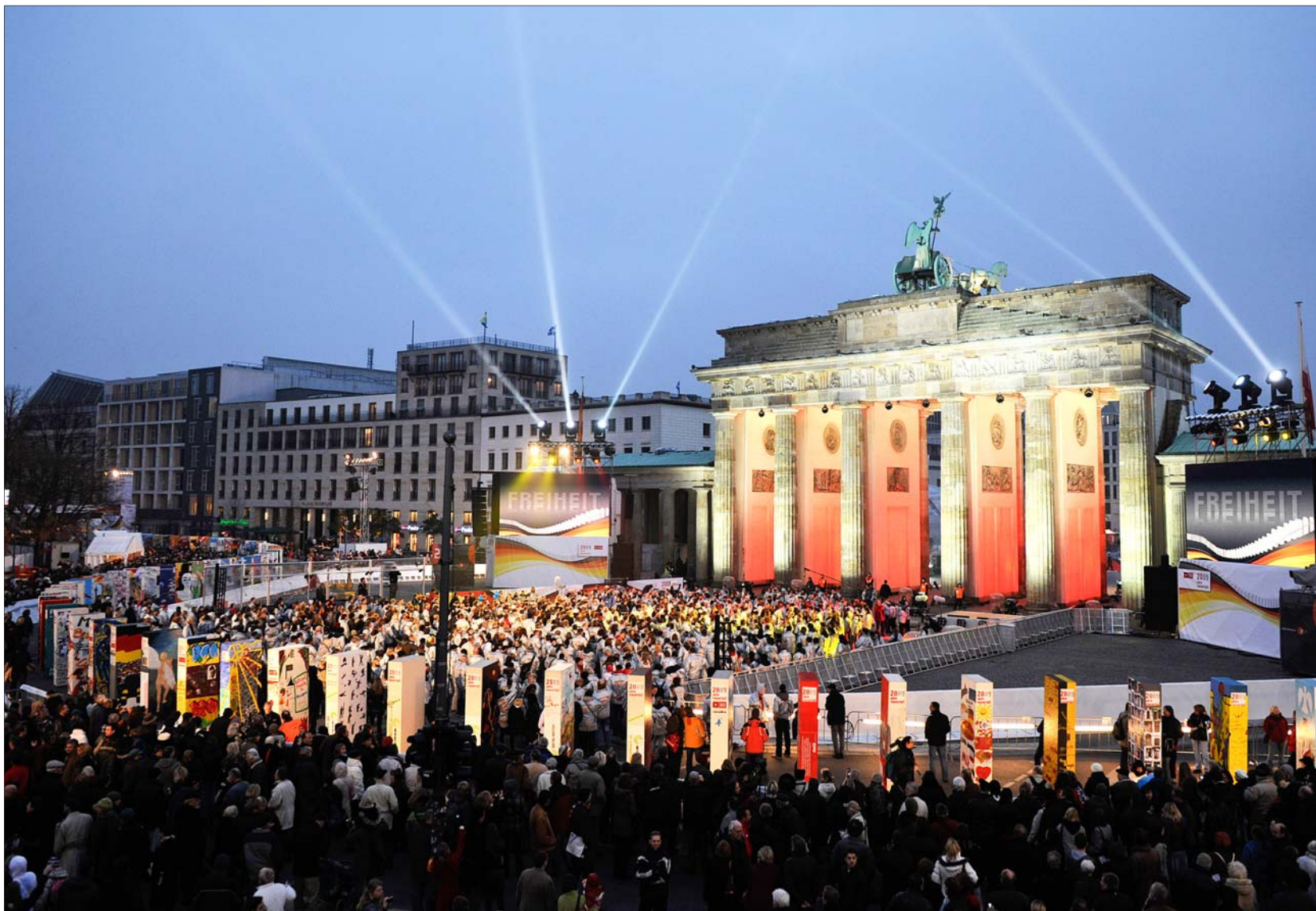
REMEMBRANCE GATHERING: Tourists gather to see the individually painted dominos along the former route of the wall in front of illuminated landmark Brandenburg Gate in Berlin, on Sunday...