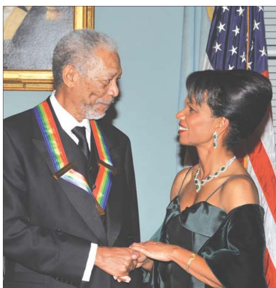
STALEY ENCOUNTER: Actor Morgan Freeman, and U.S. Secretary of State Condoleezza Rice converse at the Kennedy Center Honors at the U.S. Department of State on December 6, in Washington, D.C.

First lady Laura Bush said she and her husband were fans of George Jones, whose origins