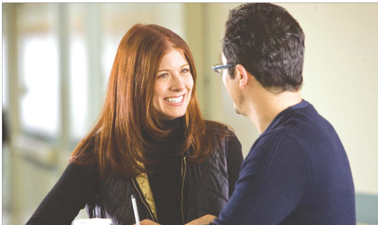
GRACE: Debra Messing and John Leguizamo in a scene from the new film "Nothing Like the Holidays."