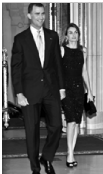
Prince Felipe and Princess Letizia in Romania.

The visit by Spain's Crown Prince Felipe supports the trend that is occurring in Romania, a country which Spain considers a