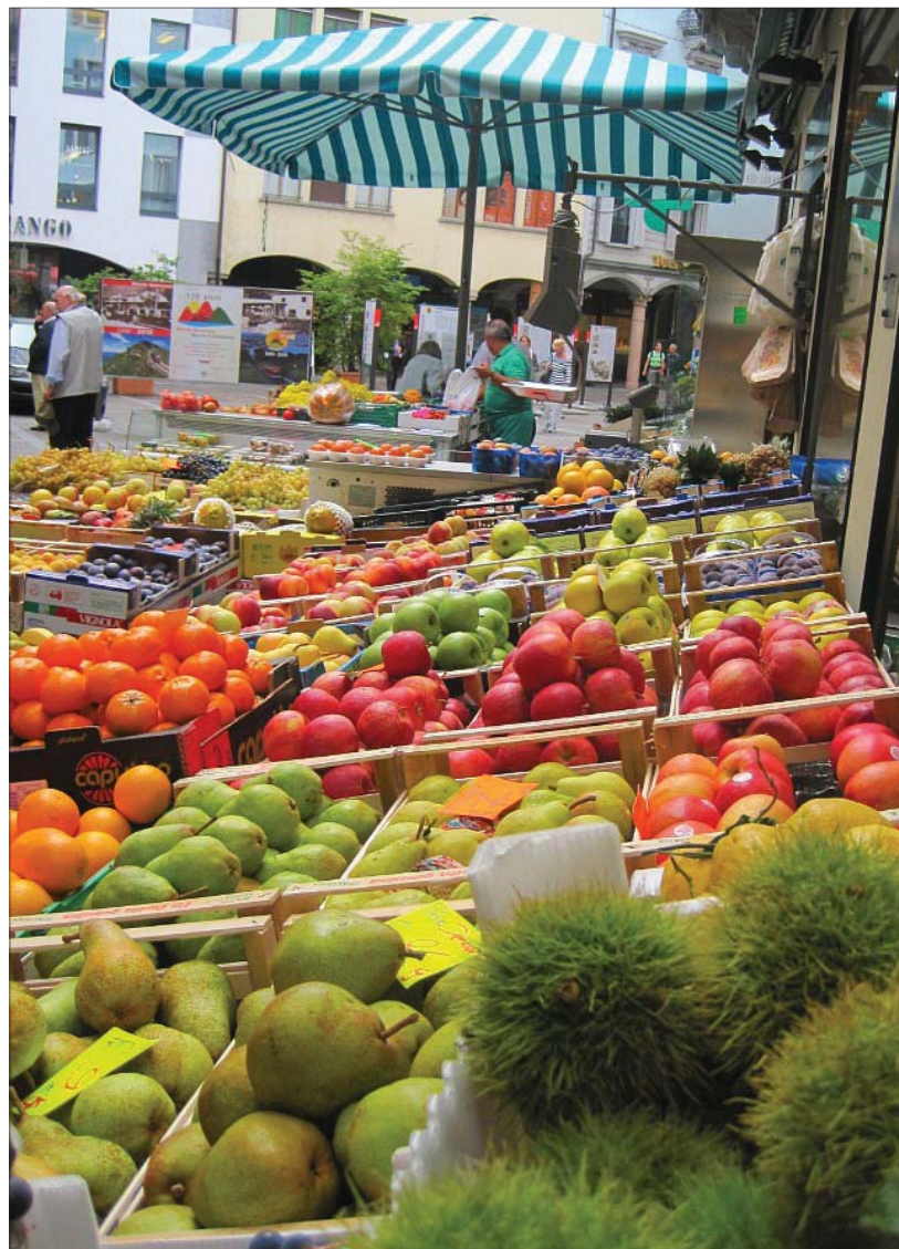
Hairy green chestnuts curl up next to rosy tomatoes and salmon-coloured fruit in an old-town Lugano market.

The Hotel De La Paix in Lugano is a short cab ride from the train station and a five-minute walk to the lake and ferry. Lugano's promenade follows the lake's contours, meanders under a canopy of trees, carves through gardens dotted with art installations, and is the preferred route for joggers, dog walkers, and sightseers.