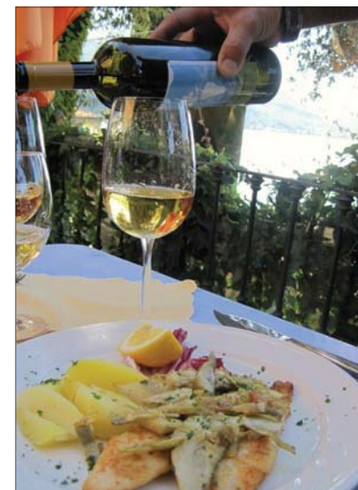
Lunch at Grotto Del Parco in Morcote features fresh perch sautéed with artichoke hearts and served with roasted potatoes, an earthy and satisfying blend of flavours.