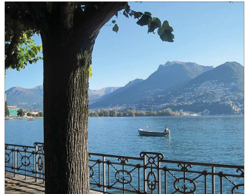
The Lugano promenade follows the curve of the lake and is a favourite for joggers, dog walkers, and sightseers.

"Secondi" we had local perch sautéed with artichoke hearts and simple roasted potatoes. The rustic flavours were earthy and satisfying. We finished our bottle of wine and last spoonful of dessert with a sigh and began our journey home to the Lugano/Paradiso waterfront.