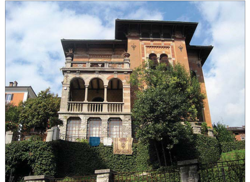
Local housekeepers have to air their rugs somewhere! KURT WINNER