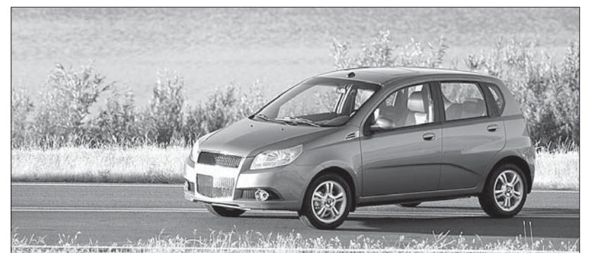
2009 Chevrolet Aveo.

Even though Aveo is purported to have more headroom than the Toyota Camry, it didn't seem to be enough for me. However, with the rear seat flipped and folded down, you can pack up to 1,200 L of gear into the back. The sedan's 60/40 rear seat split and folds allow a convenient trunk pass-through