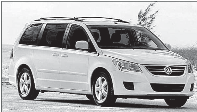
Volkswagen Routan.