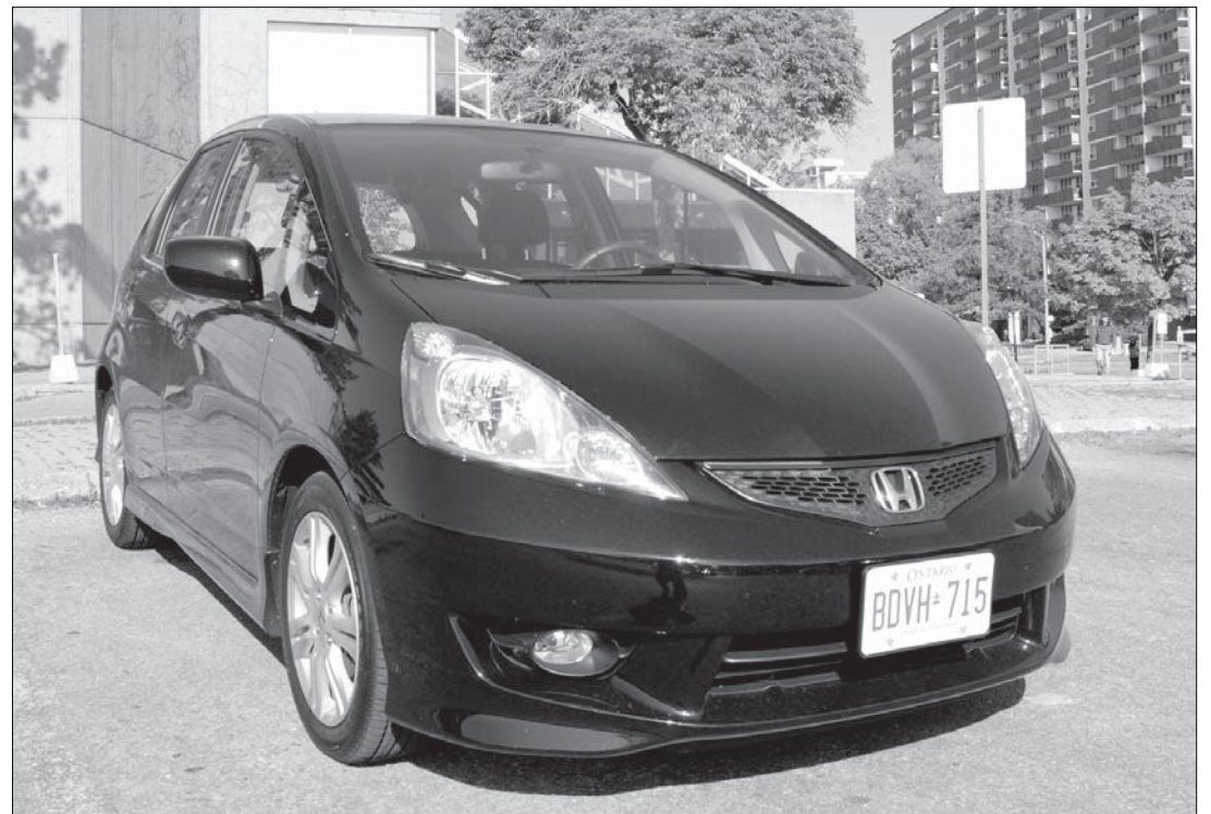
2009 Honda Fit Sport.

Even though the Fit leaves something to be desired in the acceleration department, once the car has picked up speed, it rolls with a good amount of assurance and energy. The Sport trim level is standard-equipped with P185/55 16-inch tires on aluminum alloy-wheels, and these tires give a clear feel of the how they are making contact with the road. The handling is fairly quick, and the steering feels well connected to the drive wheels. A very apparent feature of the Sport model is the under-body spoiler kit with integrated fog lights. The unique front fender in this spoiler kit makes the Sport model look much sharper and easily distinguishable from its DX and LX siblings. One disappointing thing about the feature set for the Sport model is that the automatic transmission doesn't come with Tiptronic or paddle-shifter controls. The automatic transmission is fairly competent, but for a "Sport" model, I want more control. If you can drive stick, definitely go with the manual