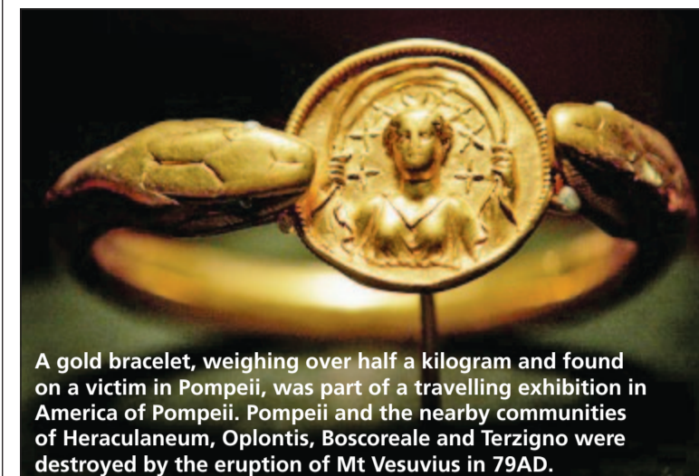
A gold bracelet, weighing over half a kilogram and found on a victim in Pompeii, was part of a travelling exhibition in America of Pompeii. Pompeii and the nearby communities of Heraculaneum, Oplontis, Boscoreale and Terzigno were destroyed by the eruption of Mt Vesuvius in 79AD.

The haunting figures of two women covering in the path of a volcanic eruption almost 2000 years ago will form the centrepiece of a Melbourne exhibition on Pompeii.