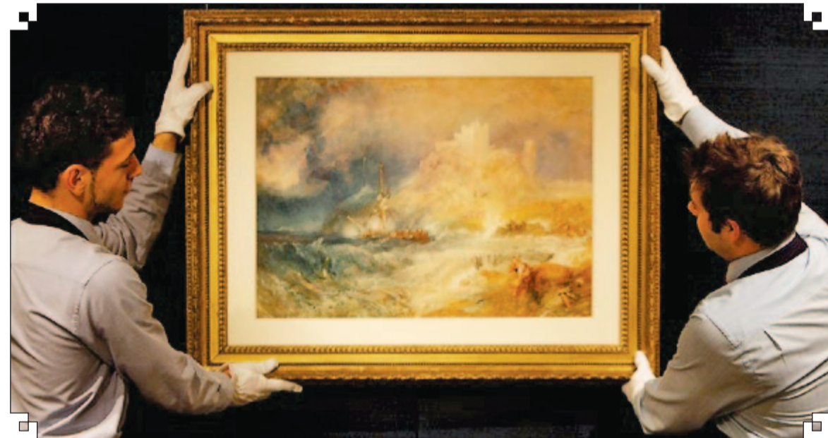
Shortly after it was painted in 1837, Bamborough Castle by British master artist JMW Turner was described by the Graphic Society as "one of the finest watercolour drawings in the world". The masterpiece has not been seen in public for 118 years and had been listed as lost. Now found, it goes up for auction on December 5 with a price tag in excess of $A5.8 million.