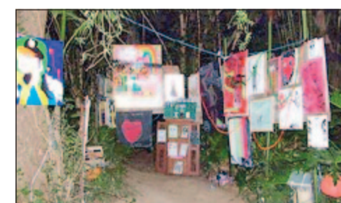
Currumbin creativity... open air art displays hang at Le Esprit gardens at the Wonderland art and music festival.

Frasca sung power ballads and her "gentlemen", backed up with metal guitars and distorted noises, provided an interactive experience for the audience. Local artist and musician Skotty Fairclough whipped up soulful one-man numbers while keeping beat with a foot tambourine.